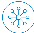
API Access Management