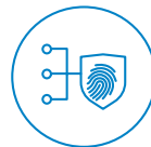
Adaptive Multi-Factor Authentication